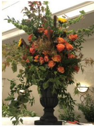
Large Pedestal Arrangement