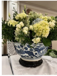
Beautiful Bowl Arrangement